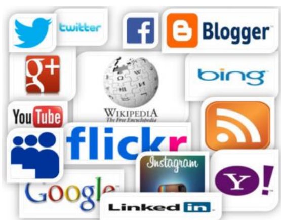
Fig 1: Common Social Media

The data mining method on social media become an essential strategy which understands the recent patterns, culture and business. This is due to that social media contains the ocean of data where in various forms data are present like tweets, instagram posts and blog articles.